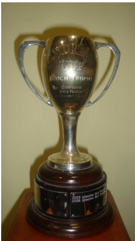
Touch Football B Grade Trophy

Note: Some information is missing at this time, please reach out if you can help us fill in the gaps!